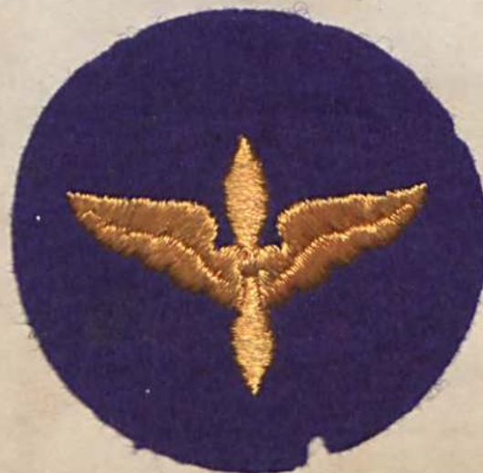
AVIATION CADET INSIGNIA